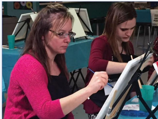
Class is in session: Uptown Painting Party, Somerset, hosted a Chamber mixer and an abbreviated painting class for members Feb. 16.

The Somerset County Chamber of Commerce Accepts These Major Credit Cards: