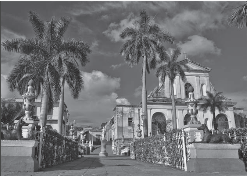
Pearl of the Antilles: Historic Trinidad is one of the many stops on Epic Journey's tour of Cuba Oct. 28-Nov. 5.