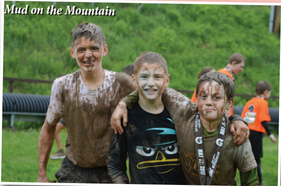
Mud on the Mountain