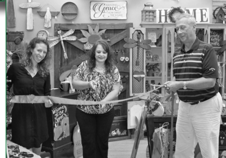
Above: George & Bob's Computer Store Diagonal: Merchant Village Right: Not 2 Shabby

Ribbon cutting ceremonies were held for three local business in the last quarter of 2018. Stop in to any of these establishments to welcome them to the area or their new location.