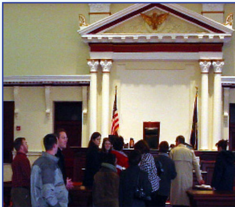
Learn About Community Issues and Opportunities