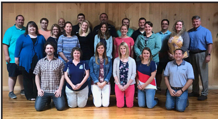
The 2018-2019 Leadership Class

For more information, contact the Chamber at (814) 445-6431 or info@somersetcountychamber.com . Recruitment for the 2019-2020 class of Leadership Somerset County will begin in July. Call to secure your enrollment.