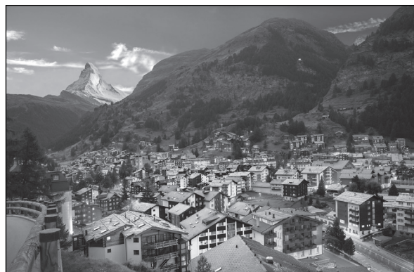
Swiss experience: The charming town of Zermatt sits beneath the Matterhorn and is an overnight stop on Epic Journeys’ Best of Switzerland tour.

For more information on this or other trips, visit www.epicjourneystours.com or call (814) 266-5070.