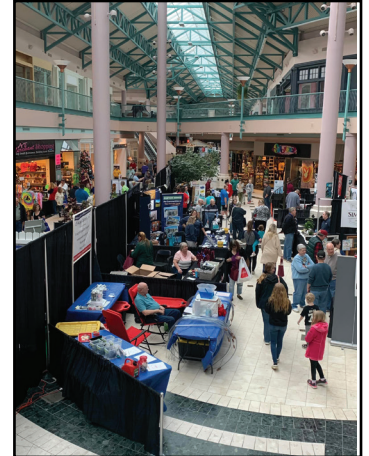
Photos from a successful 2022 Megashow