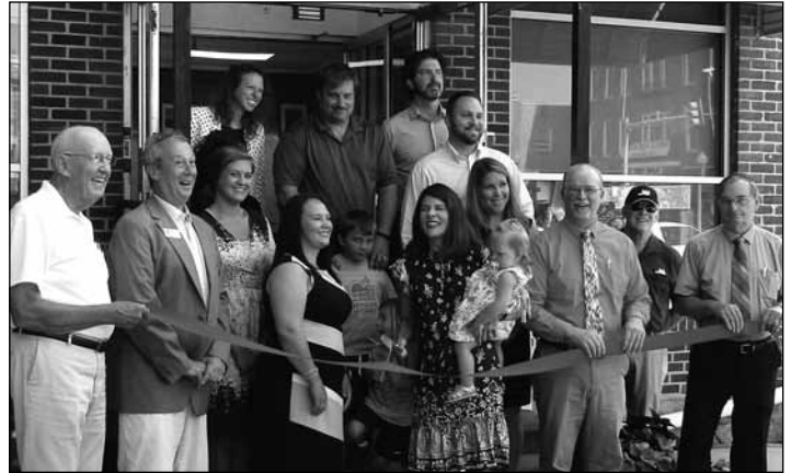
Uptown Works held a ribbon-cutting ceremony to celebrate its grand opening at 109 E. Main St., Somerset, July 16.