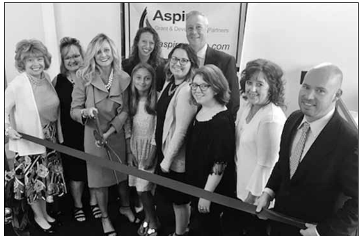
Local representatives joined Aspire Grant & Development LLC in commemorating the firm's move to 118 W. Main St., Suite 302, Somerset, on July 31.