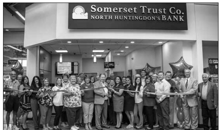
Somerset Trust Co. opened its 35 th branch, located inside the North Huntingdon Walmart, Aug. 22.