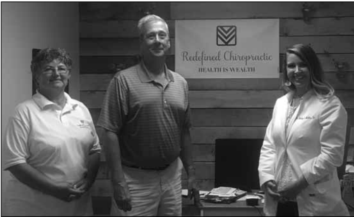
Redefined Chiropractic, 681 Main St., Rockwood, marked its one-year anniversary with an open house July 10.

The Chamber was pleased to join several members in celebrating anniversaries, grand openings, new locations, new facilities and bigger spaces in July and August.