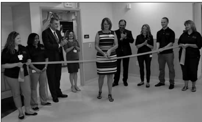
Officials with Chan Soon-Shiong Medical Center unveiled the facility's new cardiac catheterization lab Aug. 2.