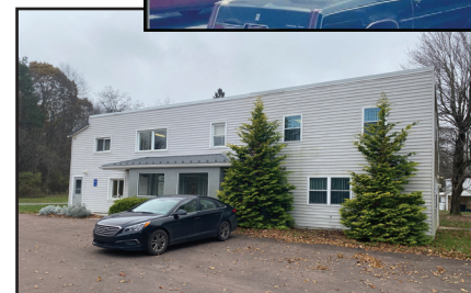
Pictured: Musser Engineering, Inc 1984 vs Present Day